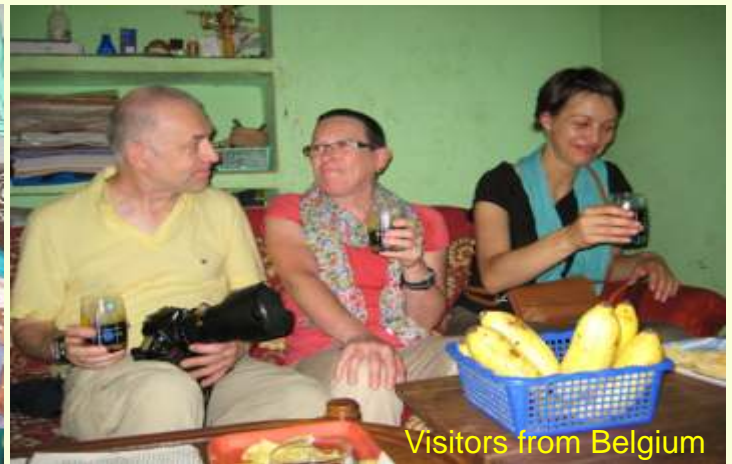
Visitors from Belgium